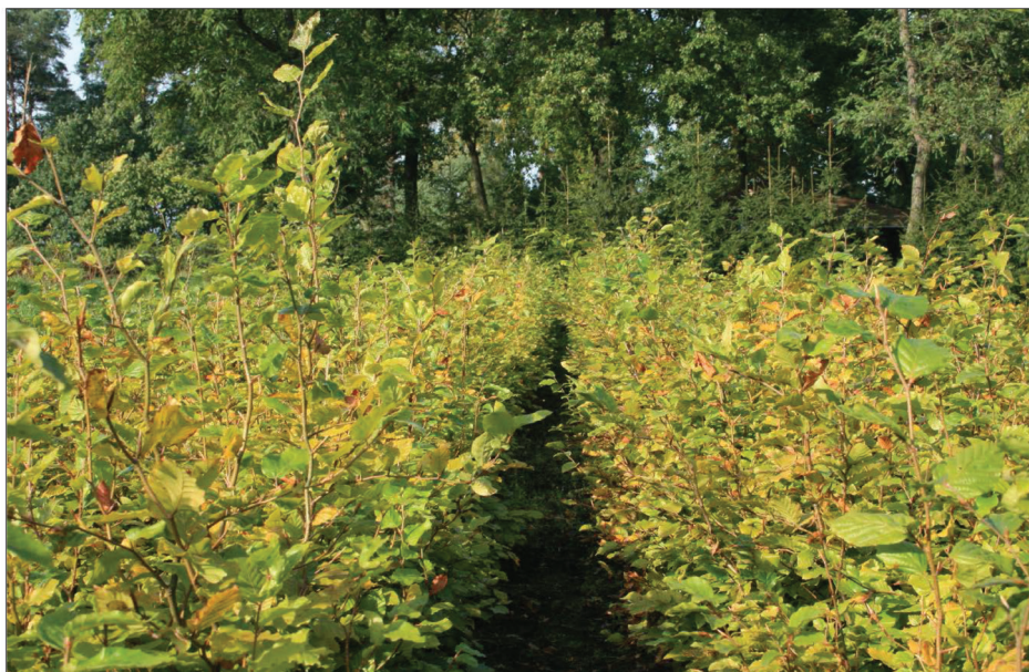
Photo 1. Seedlings of common beech in the third year of cultivation in a forest nursery

Plant growth. The growth of the beech seedlings was determined in late October. The height of the plants (cm) and the diameter of the root neck (mm) were determined. Moreover, the average number of leaves per plant and the average leaf area (cm 2 ) were determined. The results were analysed statistically with the Fisher-Snedecor test in order to establish the significance of the experimental factors, and with the Tukey test to compare the differences.