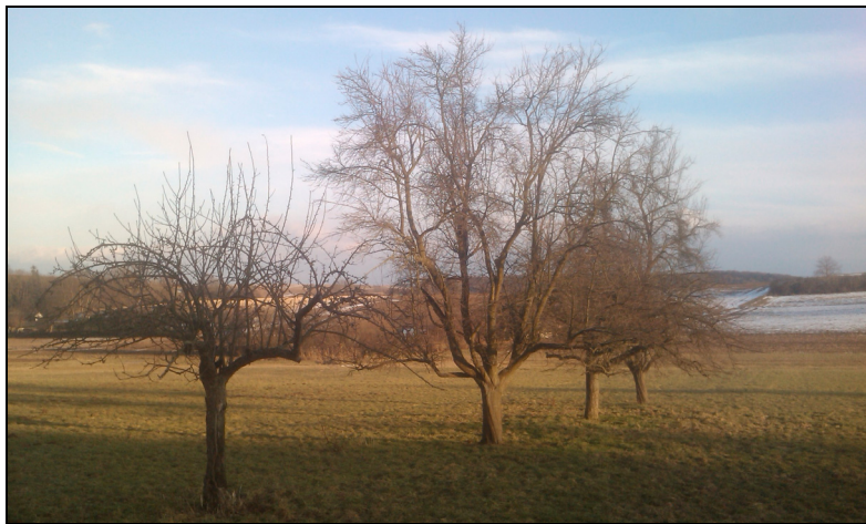
Photo 2. Non-pruned fruit trees in Hessen

will be a part of social events. Such an event could be for example harvesting fruits in autumn and the selfproduction of natural juice or fruit brandy. This is often combined with a local festival, like thanksgiving, and also offered to visitors from city regions. In that manner the problem of the lacking economic benefit is transformed into a social benefit. Therefore, it is necessary that the historical land use is legally protected and that the development of a network of people interested in using such areas is initialized.