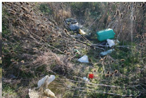
Photo. 2. Fragment of multi-point waste landfill