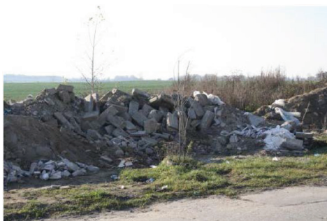
Photo. 1. Fragment of spot waste landfill

For each location, percentage content of waste deposited, as well as its surface area and volume were calculated. The surface area of each individual illegal waste landfill was calculated basing of previous (mentioned above) measurements by applying mathematical formulas for calculating the surface of various shapes (e.g. square, oval).