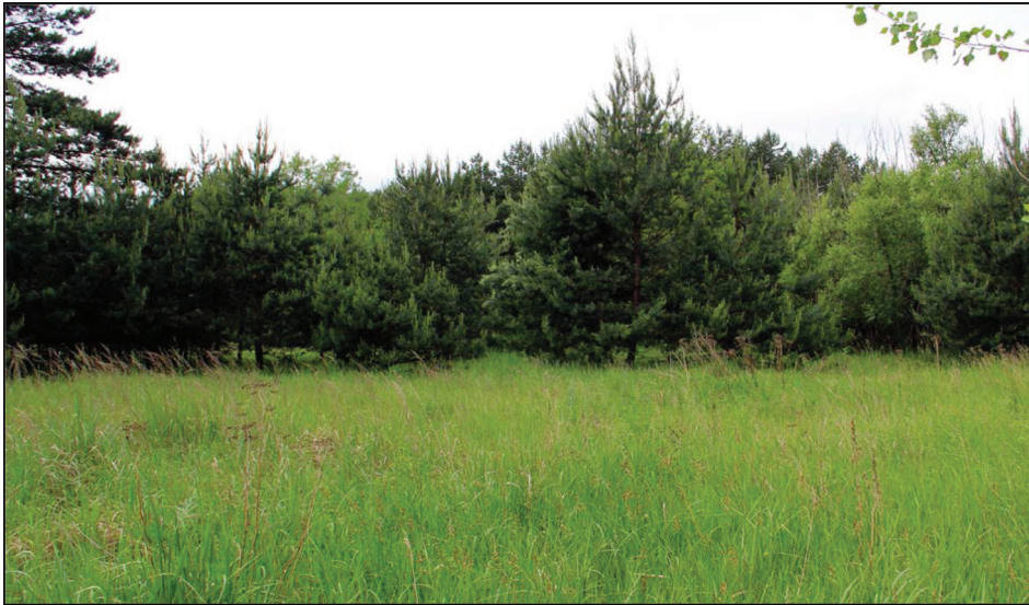
Photo 1. Site (1) city district Fordon – degraded initial xerothermic sward Tunico-Poetum compressae

site. In total, 140 soil samples were collected. The mites were extracted over 7 days using Tullergen funnels, fixed in 70% ethanol and prepared. Adult and young individuals were then classified into species or genera. The analysis covered 2707 Oribatida individuals. Mean density ( N ) of the mites was provided per 1 m 2 of soil, species dominance index ( D ) was given in %, and species diversity was described by determining the species number ( S ), mean number of species per sample for a series of 20 samples ( s ) and Shannon's diversity index ( H ).