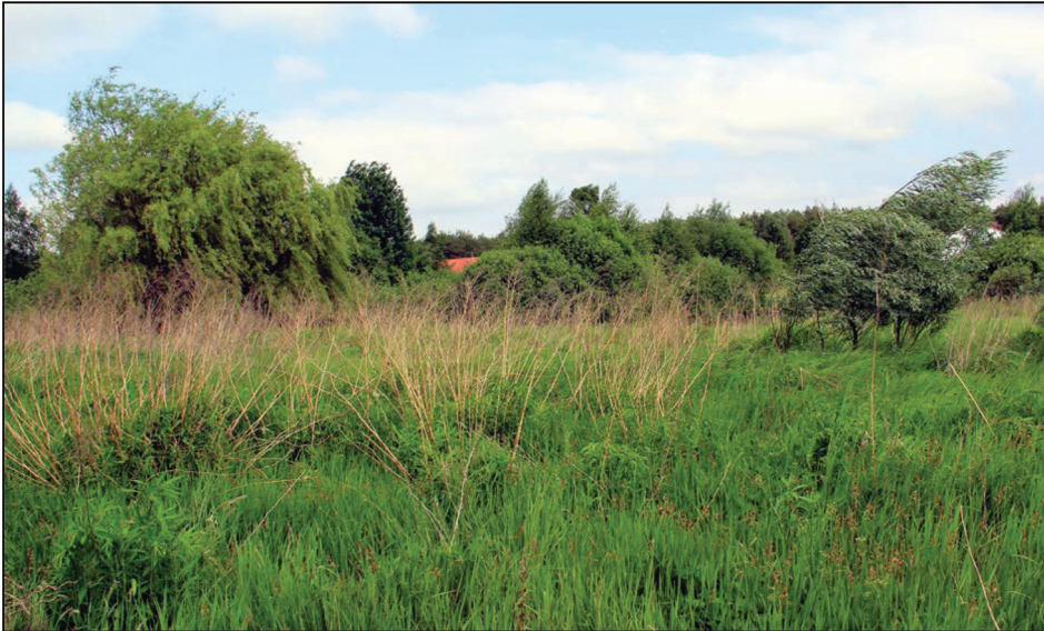
Photo 2. Site (7) Białe Błota near Bydgoszcz – grassy and herbaceous plants associated with fertile soils and elm-ash forest