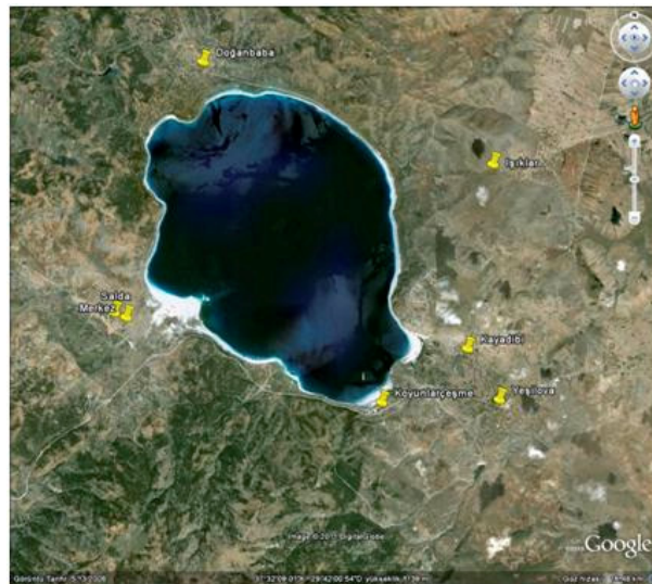
Figure 3. The coastal view of cattle breeding enterprises around the Burdur Lake