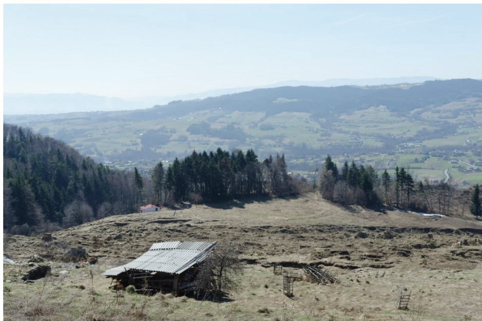
Figure. 1. The landslide niche and gully (author: Wróbel A.).

period of time and on a vast area requires properly adjusted surveying methods and equipment as well as the organisation of survey and integration of the surveying team. In the instruction issued by the National Geology Institute which describes the preparation of maps of landslides and areas threatened by mass movements in the 1:10000 scale, four phases of landslide areas monitoring were defined, namely: “The monitoring covers the following phases: the project phase, the field works and the system installation, the survey and the documentary phase” (Grabowski et al., 2008). All of the monitoring phases were described in the following study.