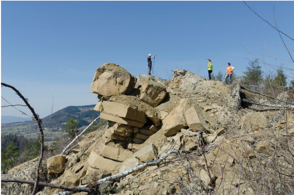
Figure 2. The inter-landslide uplifts (author: A. Wróbel).

The vertical span, that is the difference between the minimum and maximum height of the landslide is 184 m. The gradient of the landslide slope is 18^\circ , whereas the azimuth of the descent direction is 185^\circ . The height of the main slope is about 5 m, and its gradient measures about 50^\circ . The length of the colluvium is respectively shorter than the length of the landslide that includes the area of the main slope. The meridional span of the area covered by the landslide material is 1030 m with the average gradient of about 12^\circ . The height of the head of the landslide is slightly shorter than that of the main slope and measures 3 m. The thickness of the colluvium is estimated to measure about 30 m (Drwal et al., 2013).