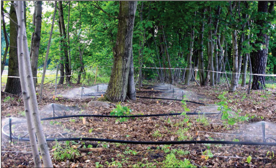
Photo 1. Irrigated microplots with litter bags under the canopy of a tree stand in the forest nursery Białe Błota

The microplots, with an area of 1 m 2 each, were set up in two rows (Photo 1). The distance between the individual microplots was approx. 1 m. For each of the three variants of the experiment, 4 microplots were established. On each microplot, 6 bags of one variant of the experiment were laid out, assuming that sampling would be carried out 6 times. The bags were laid out on a mineral soil and covered with a 5 cm layer of ectohumus.