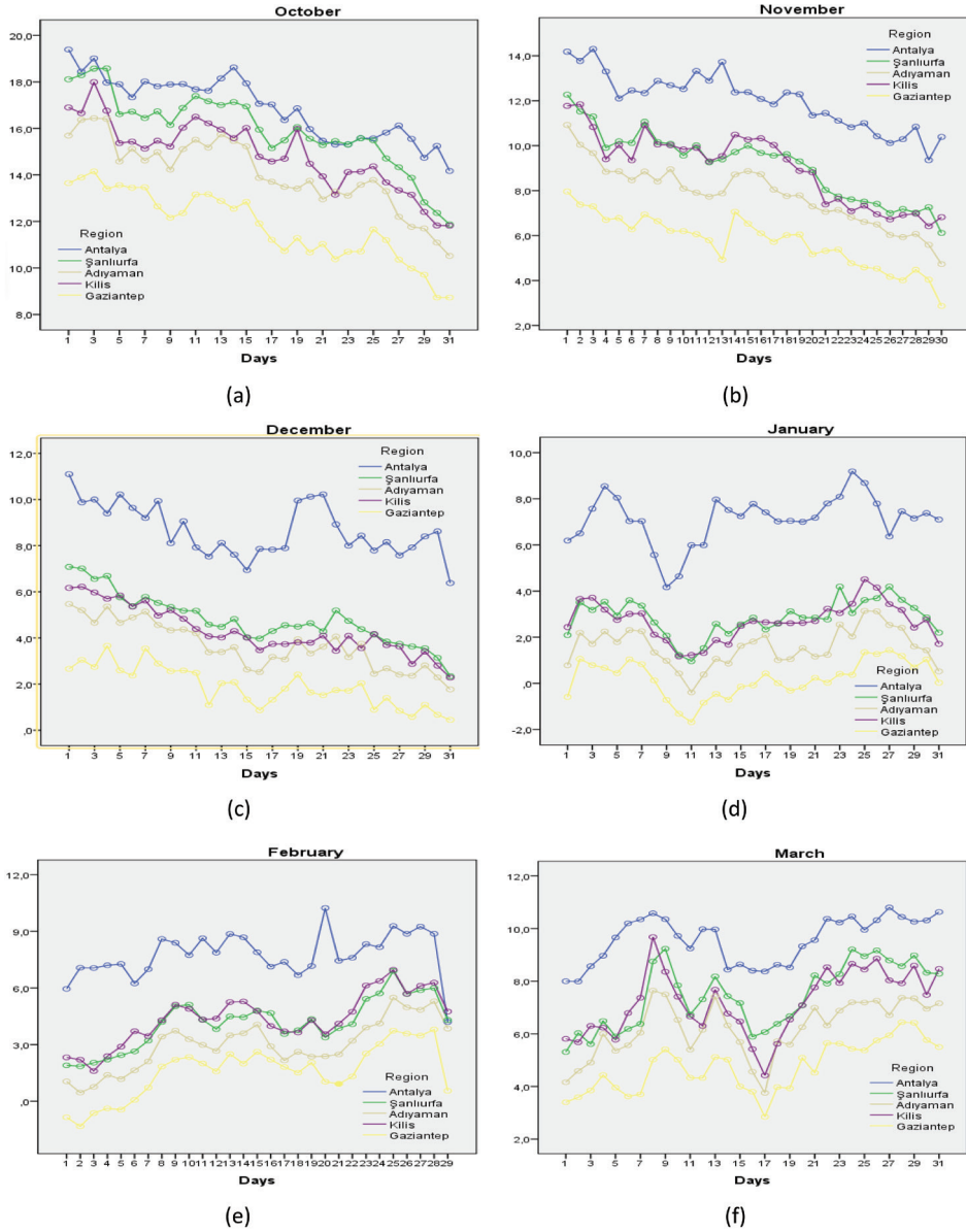
Figure 2. Average minimum temperature distribution by days for the study area in October (a), November (b), December (c), January (d), February (e), March (f)