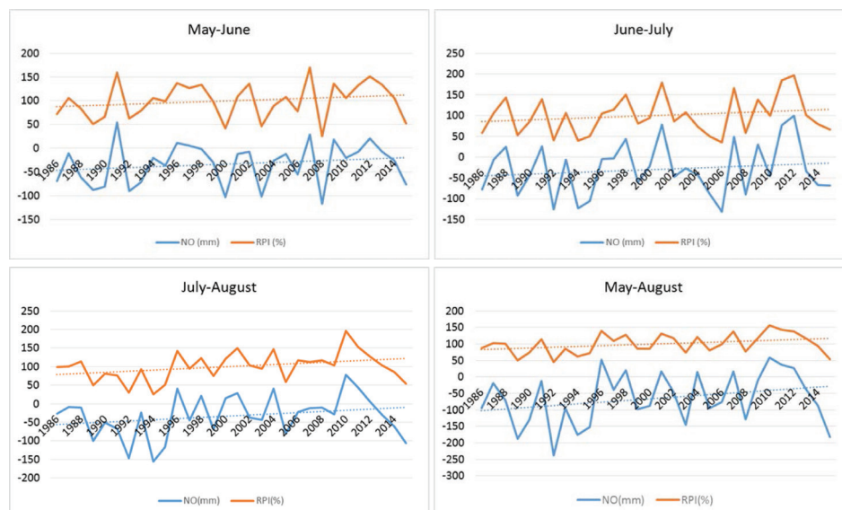
Explanations: NO – index of agricultural drought (quantitative shortages of actual precipitation in relation to Klatt's optimal precipitation) RPI – relative precipitation index