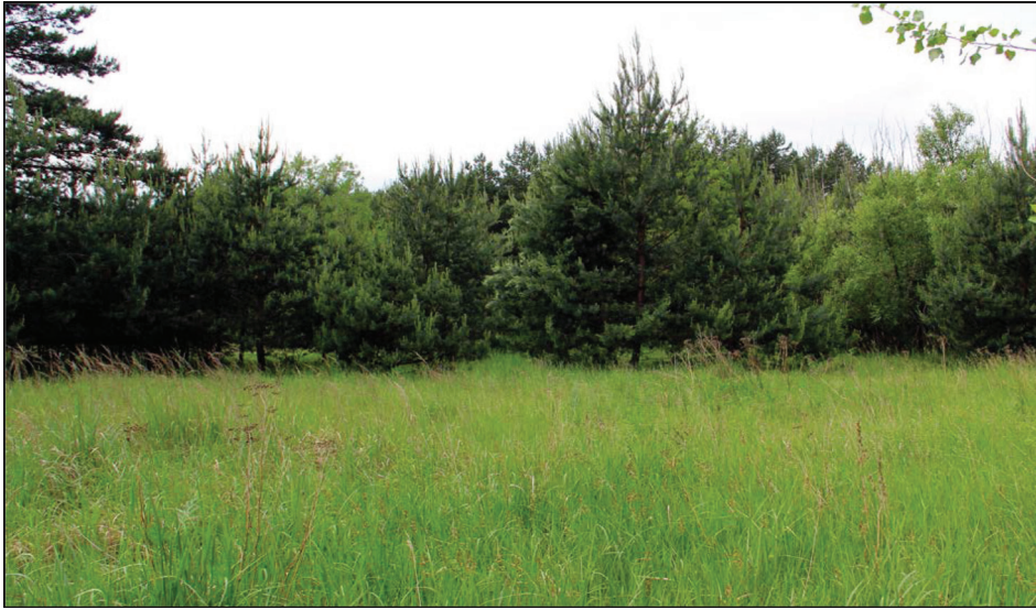
Photo 1. Site (1) city district Fordon – degraded initial xerothermic sward Tunico-Poetum compressae

site. In total, 140 soil samples were collected. The mites were extracted over 7 days using Tullergen funnels, fixed in 70% ethanol and prepared. Adult and young individuals were then classified into species or genera. The analysis covered 2707 Oribatida individuals. Mean density ( N ) of the mites was provided per 1 m 2 of soil, species dominance index ( D ) was given in %, and species diversity was described by determining the species number ( S ), mean number of species per sample for a series of 20 samples ( s ) and Shannon's diversity index ( H ).