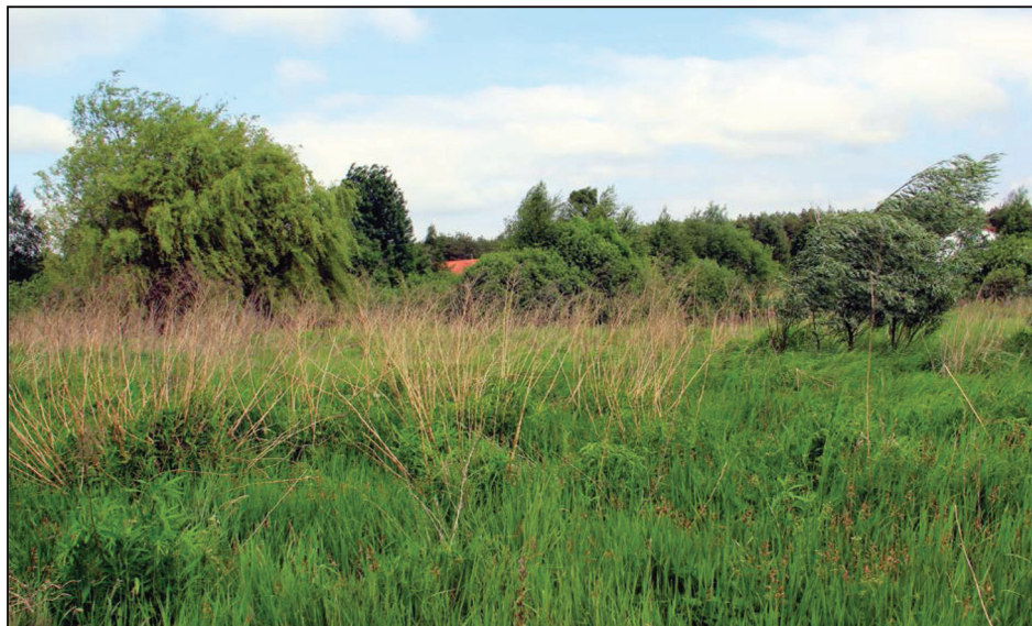
Photo 2. Site (7) Białe Błota near Bydgoszcz – grassy and herbaceous plants associated with fertile soils and elm-ash forest